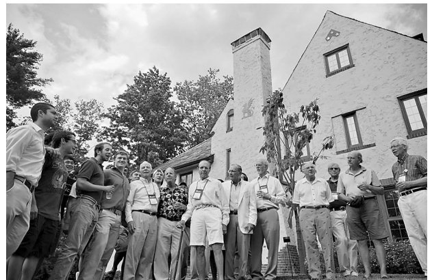
Last year, the Class of 1963 dedicated a tree at the house to recognize their lasting friendship that Beta Theta Pi nurtured.

We have a strong alumni association, a thriving active chapter and an almost 150-year legacy at Denison. If you haven't been involved in the past few years, I personally invite you to renew your participation this fall. As you can see, there's no reason not to.