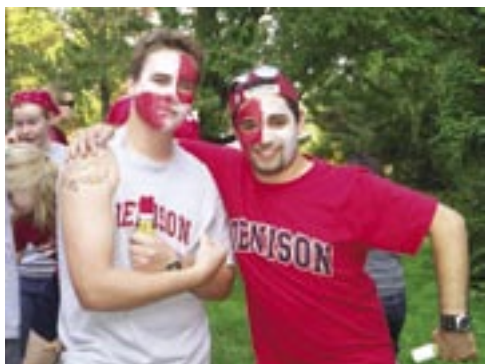
Left: Two Betas get into the spirit before a Denison football game.