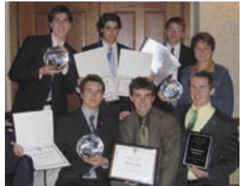
Beta won 12 Greek Awards at Denison's Greek Award Night.