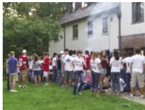
Right: The house had a cookout for the entire campus before Denison's first home football game this year.